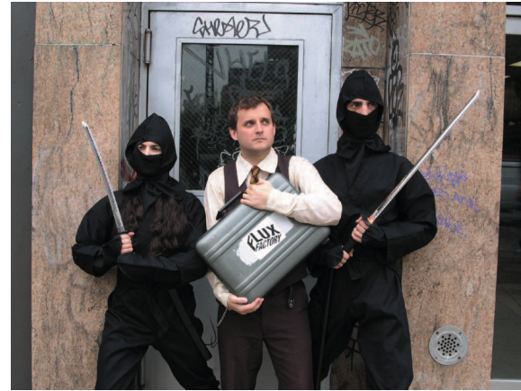
Flux Factory Secret Places , 2004 Site-specific installation Location: Bowery Martial Arts, 246 Bowery

Armed with the secret password "gert frobe," visitors to Bowery Martial Arts can gain access to a part of the store typically off limits to the public: a back room that serves as a secret headquarters. Visitors will be asked to take on a new identity and go on a secret mission. Missions range from the silly to the sublime, from clandestine deeds requiring the greatest stealth and cunning to truly trivial fun. Viewers will also be able to read about past missions and activities of the club's agents, and view other important documentation. In Secret Places , Flux Factory turns a normal retail experience on its head by making it a portal to a world of covert purposes. Once we allow ourselves to be immersed in the sense of play, adventure, and risk, our perceptions of the neighborhood change: possibilities open up, communities become revealed, and hidden places make themselves known.