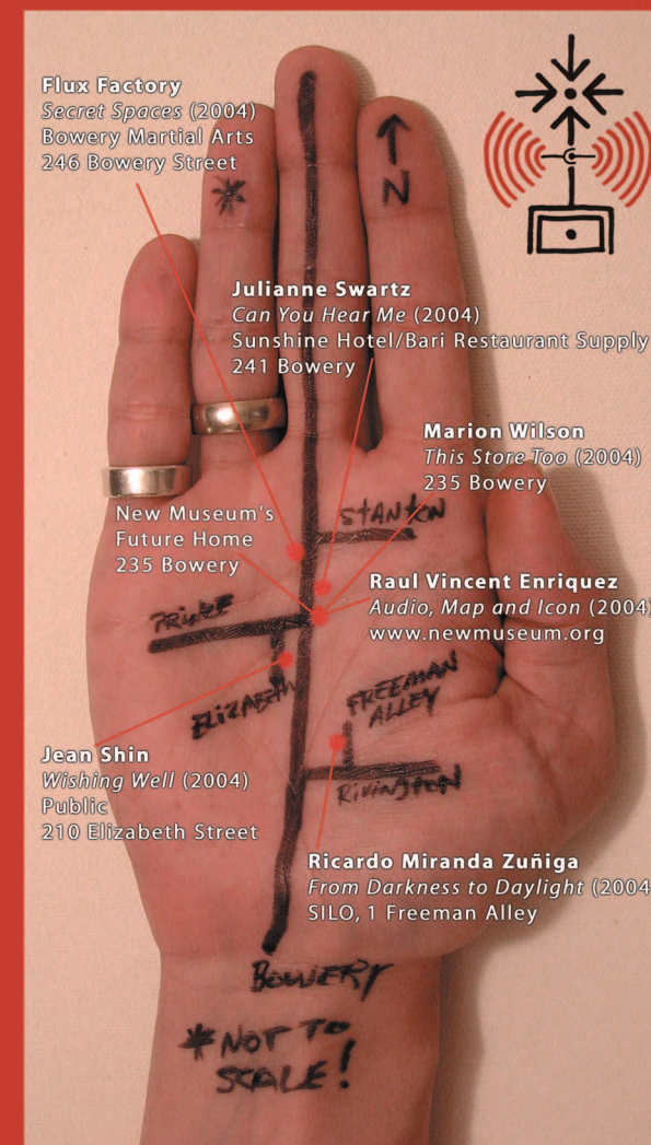
Flux Factory Secret Spaces (2004) Bowery Martial Arts 246 Bowery Street